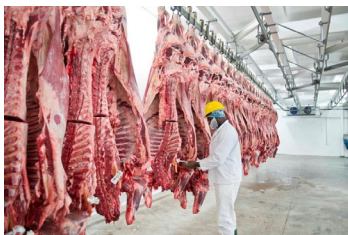
Processing & Packing (fruit, vegetables, chicken, eggs, pork, beef, lamb or other livestock)

CIRCLE all that apply below, even if the work was only for a short period of time.