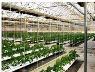
Nursery or Greenhouse (planting, potting, pruning, watering, harvesting)