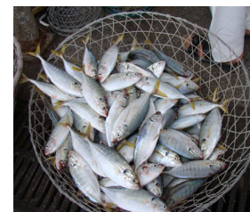
Fishing & Fish Processing (catching, sorting, packing, transporting fish)

This form and the data recorded within are protected to maintain family and child confidentiality. If you have any questions, please contact: