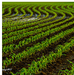
Agriculture or Field Work (planting, picking, sorting crops, soil preparation, irrigation, fumigation)