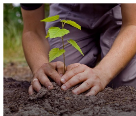
Forestry (soil preparation, planting, growing, cutting trees)